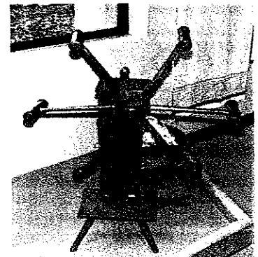
Weasel or yarn reel

The niddy-noddy also has its own rhyme: "Niddy-noddy niddy-noddy, Two heads and one body."